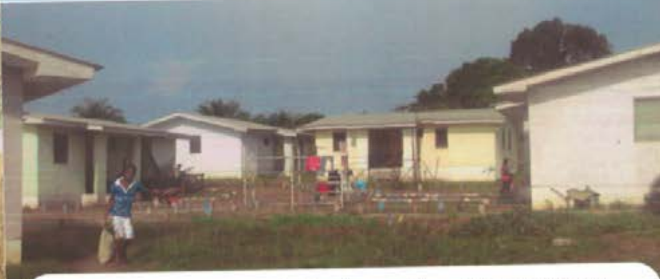
Affordable Housing in Buchanan Grand Bassa County