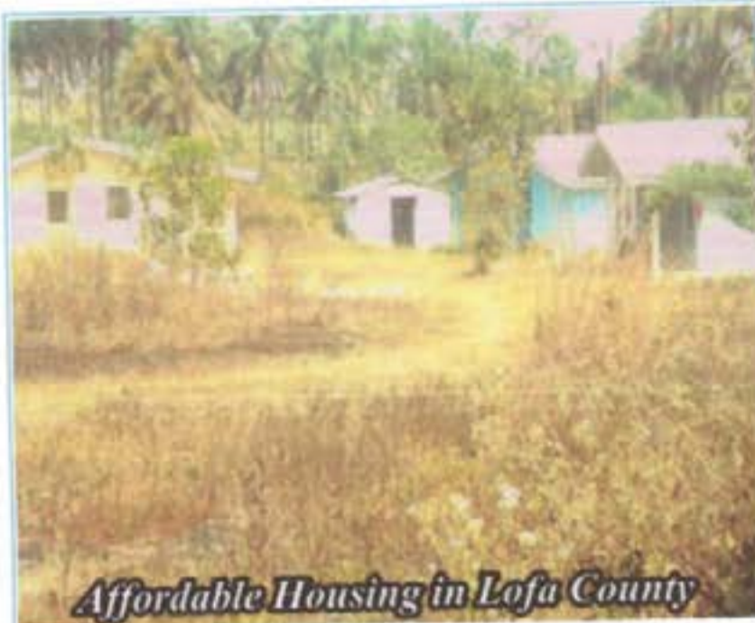
Affordable Housing in Lofa County